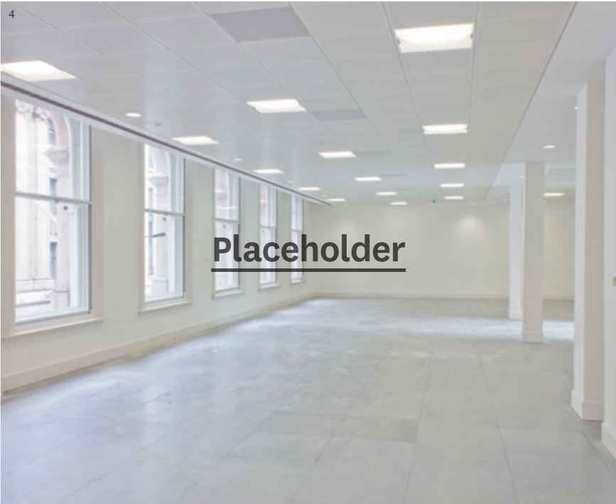
4th floor 3,173 sq ft - 295 sq m